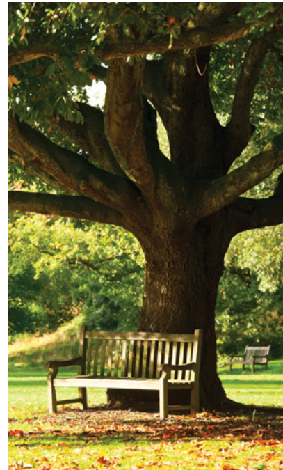
4. Bench under the tree in the Royal Botanic Gardens in London.

Although a national health program for shinrin-yoku began to be introduced in 1982 by the Japanese Forest Agency, there has not been sufficient medical evidence supporting the beneficial effects of forest bathing due to technical limitations regarding measurements, and evidence-based evaluations. A therapeutic menu of forest bathing benefits then came into demand. Against this background, the Japanese Society of Forest Therapy was established in 2004 for conducting the evidence-based research on the effects of forest environments on human health. The Ministry of Agriculture, Forestry and Fisheries of Japan initiated a →