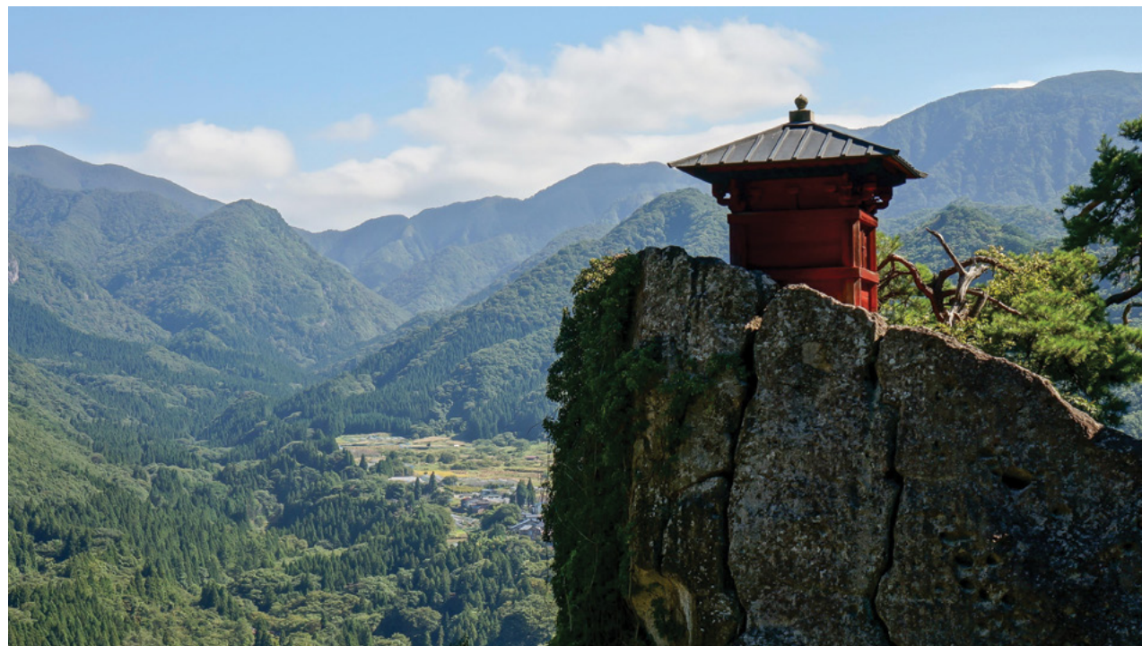
5. Scenic temple located in the mountains northeast of Yamagata City. The temple grounds extend high up a steep mountainside, from where there are great views down onto the valley.

In 2012, we established Forest Medicine as an official new medical practice.